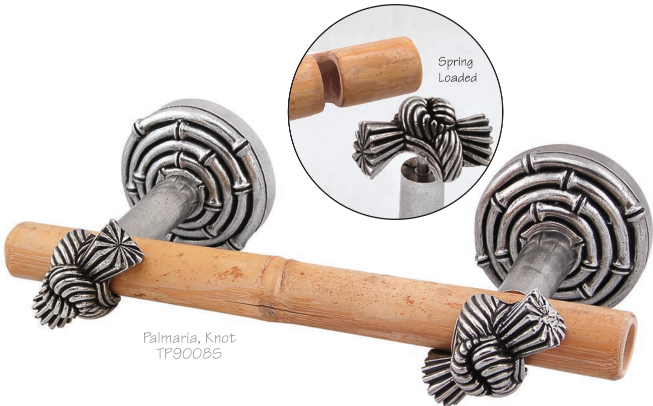
Palmaria, Knot TP9008S